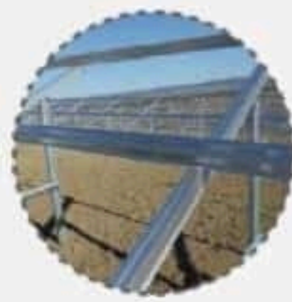
Mounting of Structures