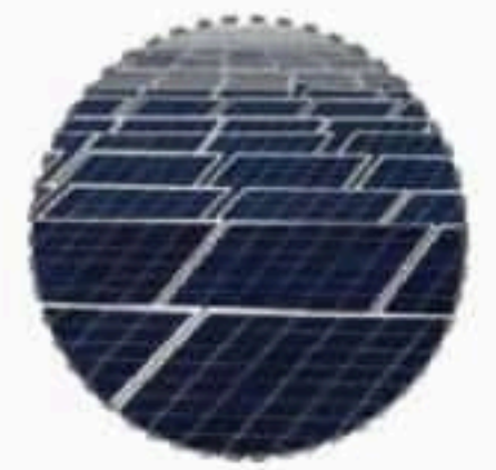
Testing Plant & Connection to the Grid