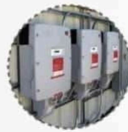
Mounting & Wiring of Inverters