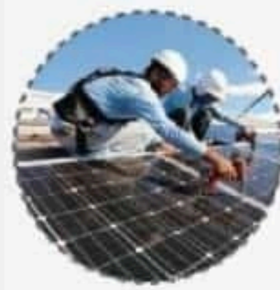
Mounting & Wiring of PV Panels